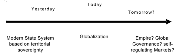
Chart 1: World Order Conceptions

thinking and doing and allow us to demarcate them from other worlds. World orders can be imagined on the continuum from spontaneous interactions, such as the market to transcendently-legitimized hierarchical systems (Hardt and Negri, 2001). This can be better understood if placed in a historical framework as is shown in the following graphic: